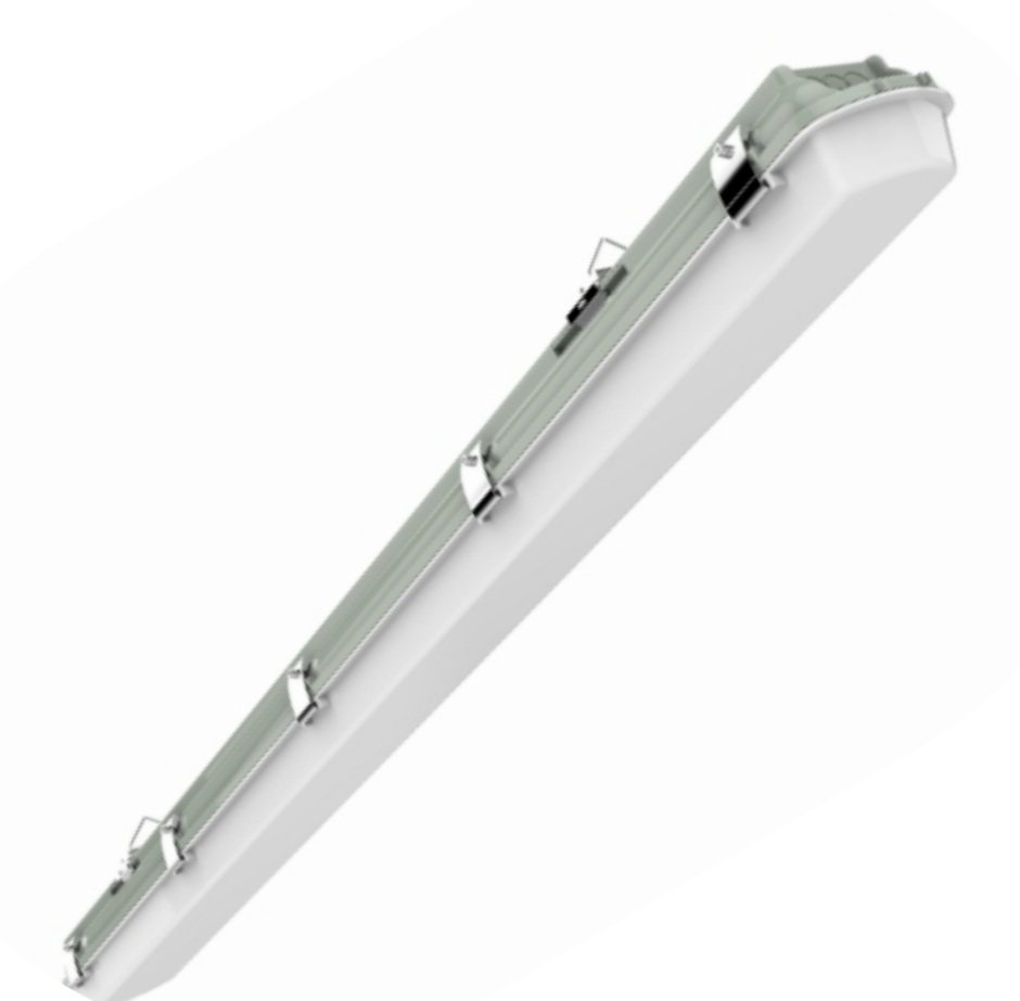
BATTEN IP65 (Water Proof)