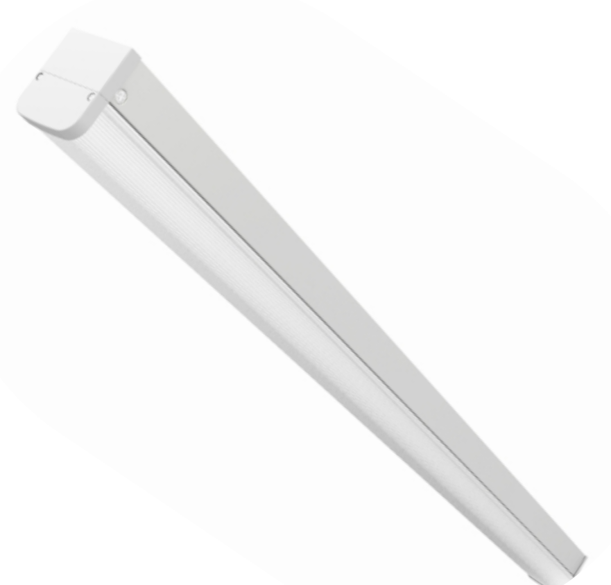
BATTEN IP20 (In Door)